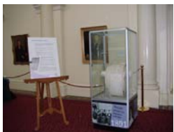
The original petition on display in Parliament House as part of the final celebrations.